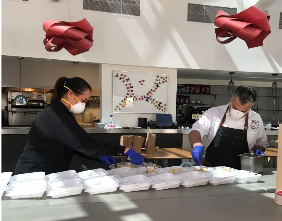
Bowers Museum's Tangata Restaurant serves healthcare workers at Hoag Hospital