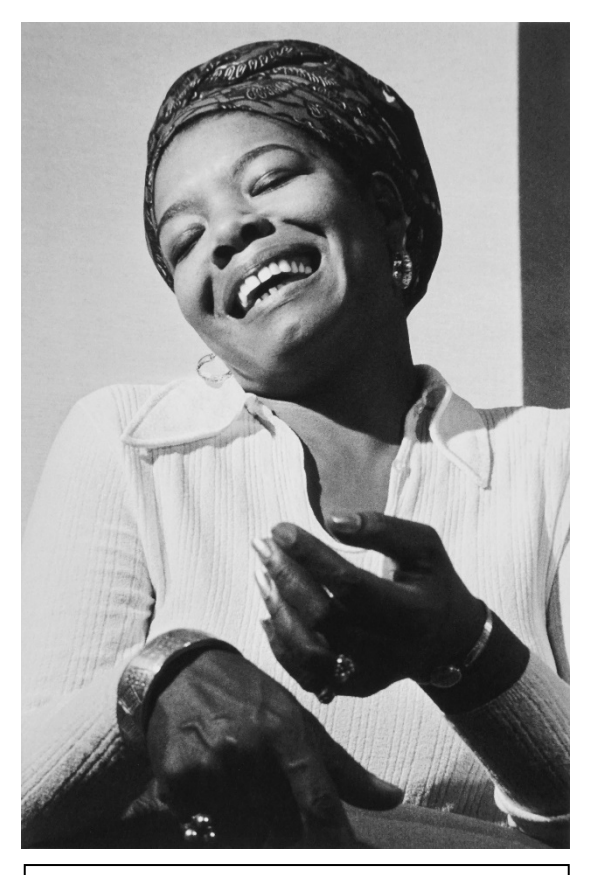
Chester Higgins Jr., Maya Angelou , 1969, © Chester Higgins, Courtesy of Peter Fetterman Gallery.

The Power of Photography is organized by Photographic Traveling Exhibitions, Los Angeles, CA. This presentation of The Power of Photography is made possible with generous support from The Ronald C. and Kristine Pietersma Family Trust.