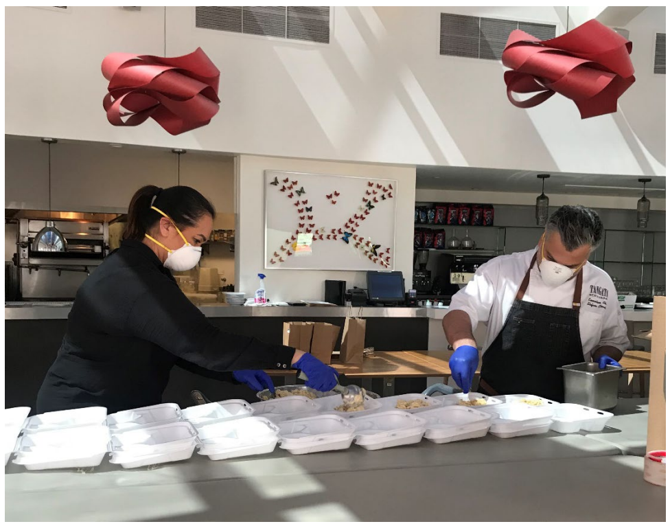
Bowers Museum's Tangata Restaurant serves healthcare workers at Hoag Hospital