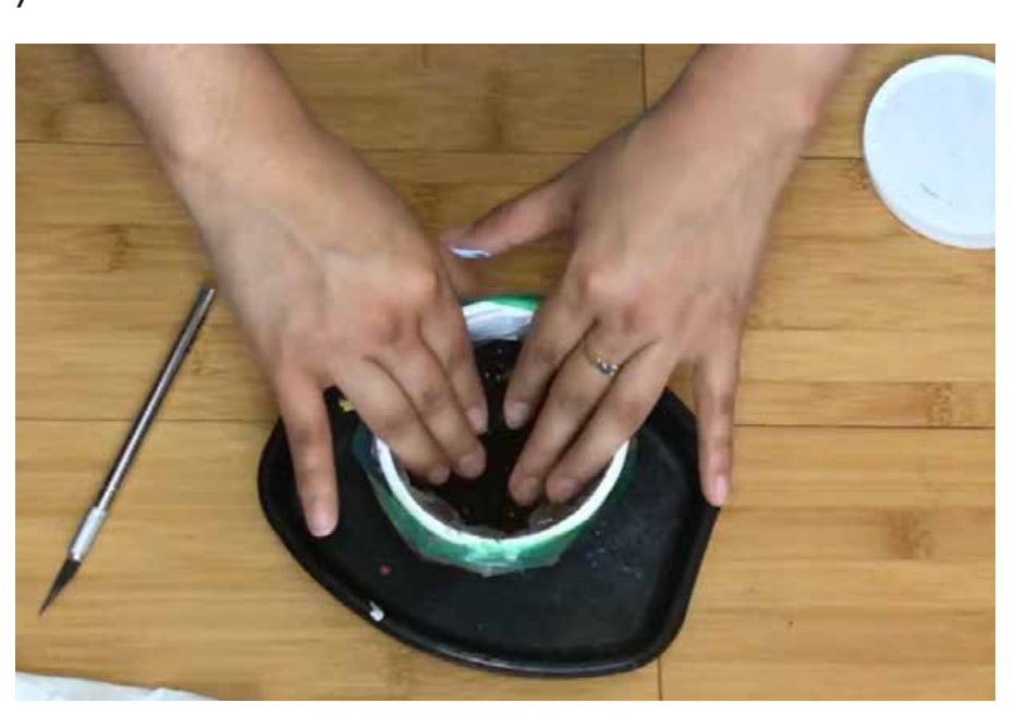
Place your plant outside in the sun. Water regularly and watch it grow.