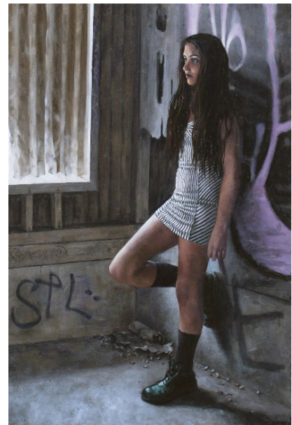
Therese Conte, The Old Zoo , oil on canvas, 36x24 inches

The artwork that will be unveiled at the Bowers Museum will feature picturesque landscapes that defined early Gold Medal Exhibitions, as well as grittier urban scenes and figurative works that represent the diversity of the Golden State and its fine artists, many of whom have immigrated from their native countries.