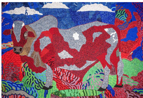
Zondile Zondo, I am ill, I still see Color and Beauty: Jamludi The Red Cow , 2012, glass beads sewn onto fabric.