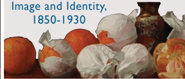
Image and Identity, 1850-1930