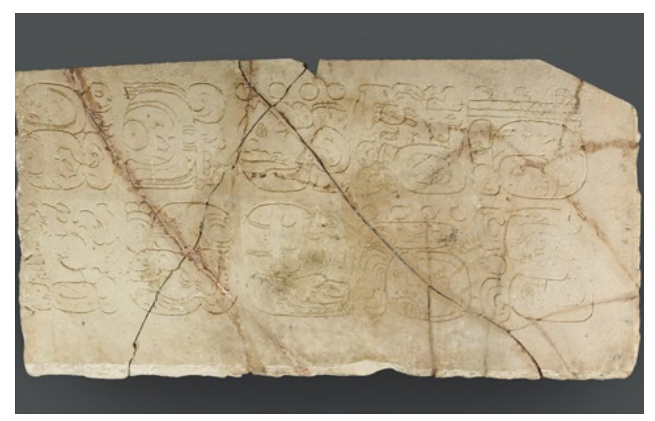
Glyph Panel, probably Classic Period (250-900) Maya culture; Palenque, Chipas, Mexico Carved limestone; 45 1/2 x 23 in. The Dr. Eli B. and Aimee Cohen Memorial Collection

Unlike other civilizations that used letters to write, the Maya used images that represented sounds, words or syllables. These are called glyphs. The Mayan glyphs are very similar to the written language of the ancient Egyptians.